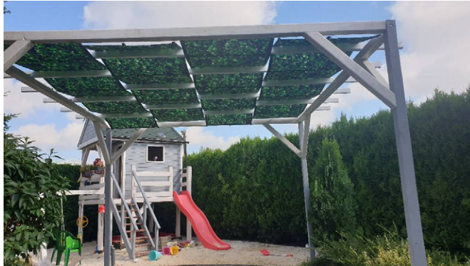
Figure 1. Gazebo strips of decor fabric with single-sided print.